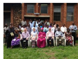
Rooted in Jesus conference, Diocese of Upper Shire