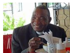
The National RinJ Conference in Tanzania