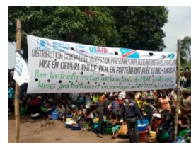
Food relief in Kalémie