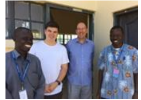
RinJ Conferences in Uganda