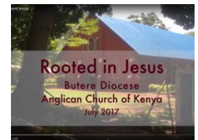
Video from the RinJ conferences in the Diocese of Butere, Kenya