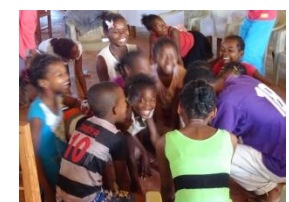
Workshops in the Diocese of Toliara

The Mathetes Trust UK Reg Charity 1169869 www.rootedinjesus.net www.mathetestrust.org